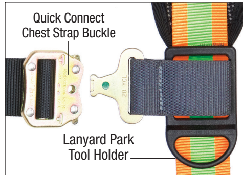
Quick Connect Chest Strap Buckle