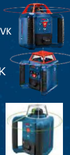
GRL 300 HVG